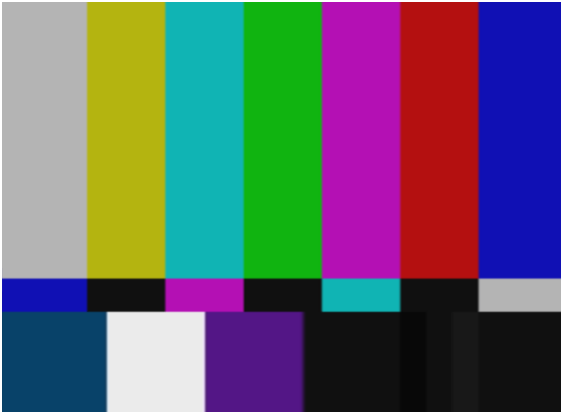
Figure 1 – SMPTE Bars Image

Load the SMPTE Bars image into MATLAB from the YUV data file. Load the SMPTE Bars image into MATLAB from the RGB data file, and then perform a MSE error comparison of the two files by converting the YUV file to RGB. Do not round the RGB values to 8 bits in your conversion.